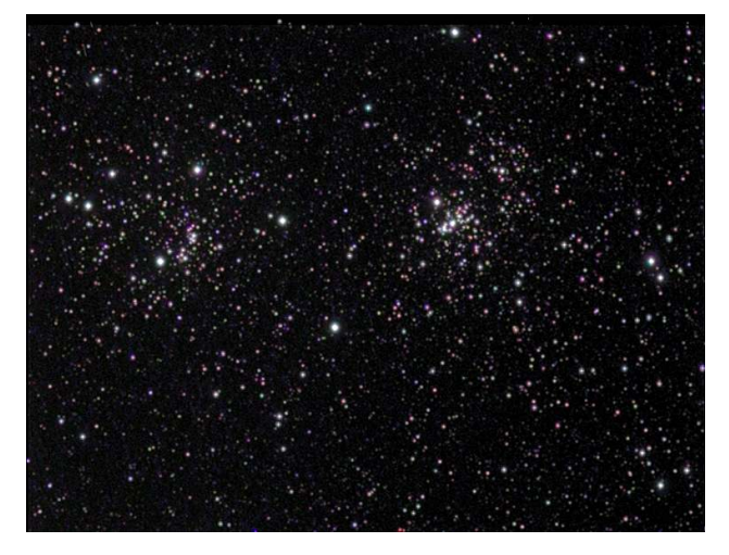
The Double Cluster in Perseus

For centuries our ancestors looked at the heavens with a great familiarity of the night sky. The Milky Way streaming across the sky, with little patches of loosely connected stars dotting the scene. As ancient societies observed more, and integrated their knowledge of the heavens into their culture and mythology, the patches of light where given names; the Pleiades in Taurus, Praesepe in Cancer, the Hyades in Taurus, and the glorious Double Cluster in Perseus. These names became stories, folklore, to be passed down from generation to generation.