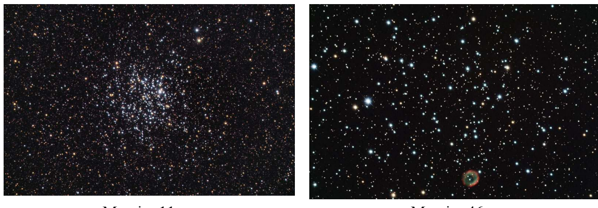
Messier 11