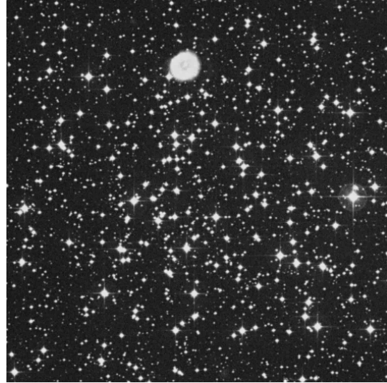
M46 15.0' Class: II 2 r