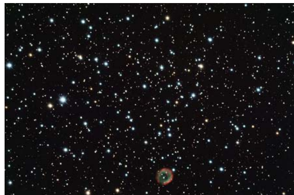
Messier 46