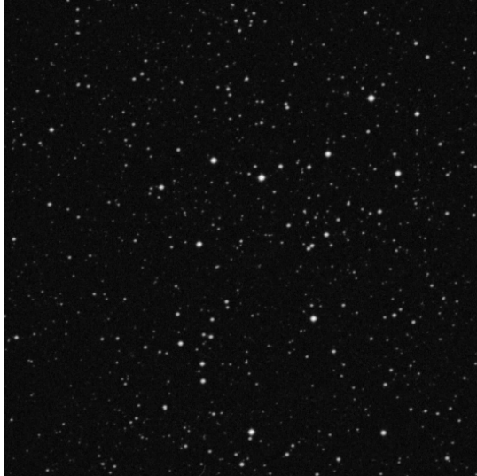
NGC 6664 15.0' Class: III 2 m