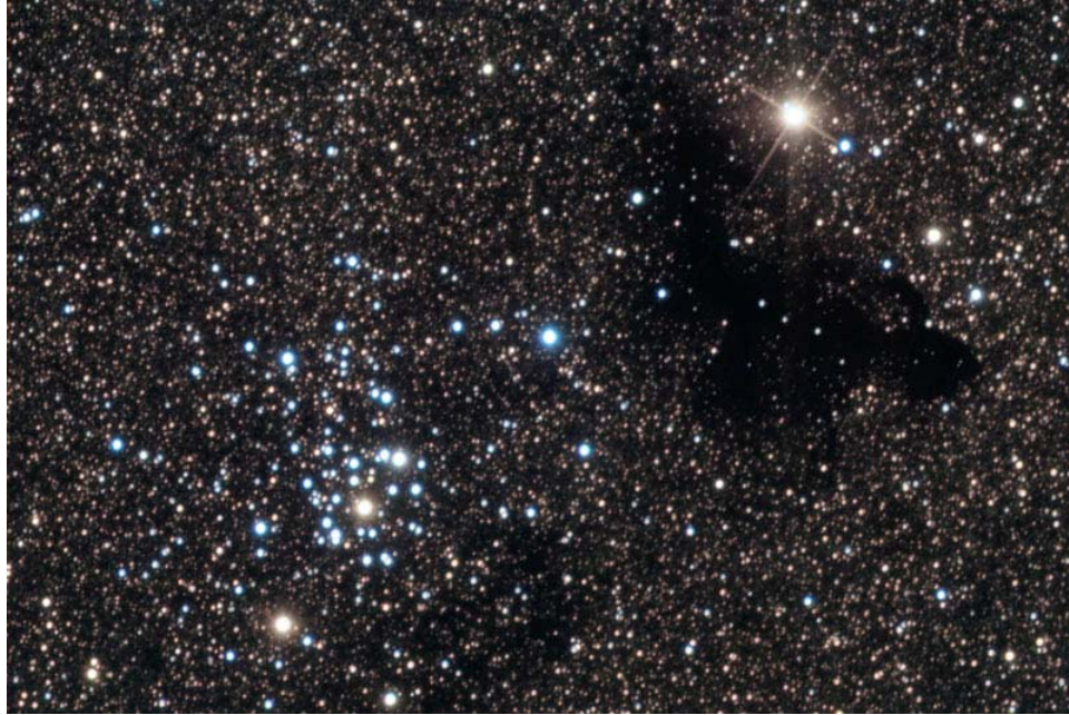
NGC 6520 (left) and Barnard 86 (right) Cover: M 45