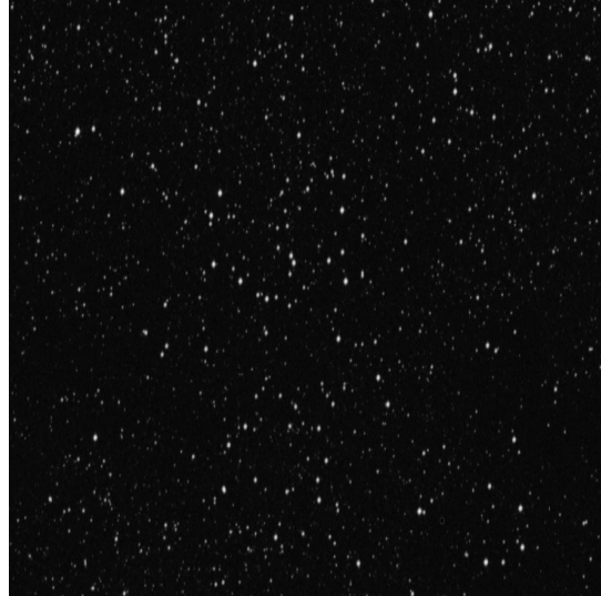
NGC 6568 25.0' Class: IV 1 m