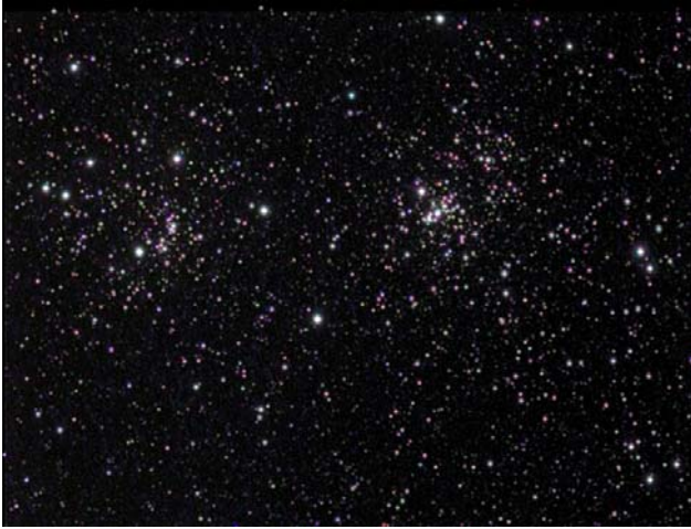
The Double Cluster in Perseus

For centuries our ancestors looked at the heavens with a great familiarity of the night sky. The Milky Way streaming across the sky, with little patches of loosely connected stars dotting the scene. As ancient societies observed more, and integrated their knowledge of the heavens into their culture and mythology, the patches of light were given names; the Pleiades in Taurus, Praesepe in Cancer, the Hyades in Taurus, and the glorious Double Cluster in Perseus. These names became stories, folklore, to be passed down from generation to generation.