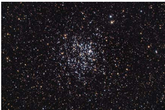
Messier 11