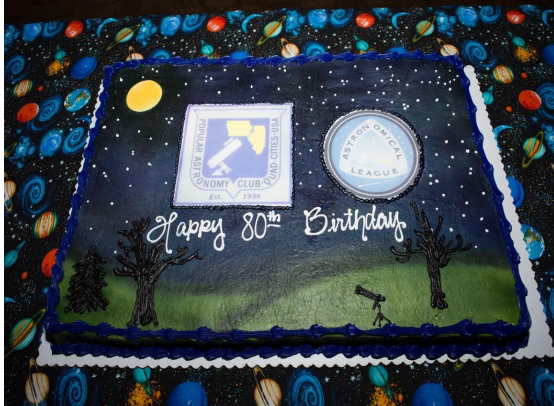
An astronomy-themed cake to celebrate