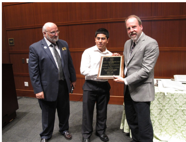
One of two 2016 1st place NYAA winners

Please see www.astroleague.org/al/awards/awards.html for complete details of the exciting new program!