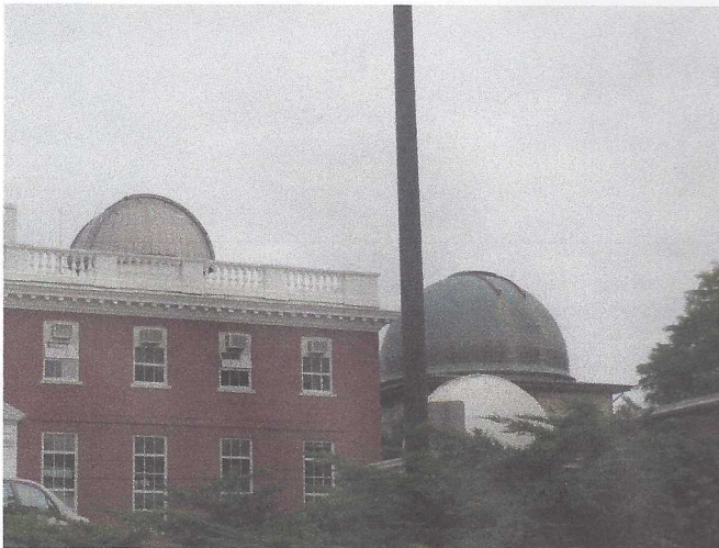
Harvard Observatory Complex

The process requires perusal of the .jpg images from the original telescope logbooks used for each telescope to transcribe the appropriate and necessary information that will allow the scanning of each plate. This usually consists of transcribing the RA, Dec, Start time, Stop Time, Hour Angle, Date, and occasional comments that are associated with each plate. Several League members have already signed up. Please contact us by December 31 if you want to be part of this special project.