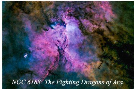
NGC 6188: The Fighting Dragons of Ara

The Williamina Fleming Imaging Award recognizes achievements in deep-sky, solar system, and wide-field astronomical imaging by female Astronomical League members who are 19 years of age or older.